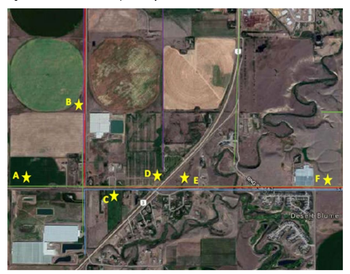
Figure 2. Identification of preliminary sites